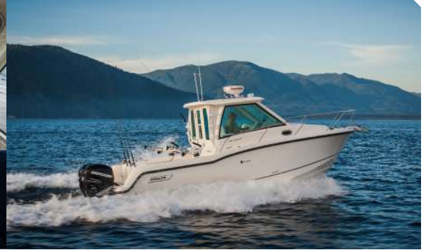
Speed Fuel Consumption